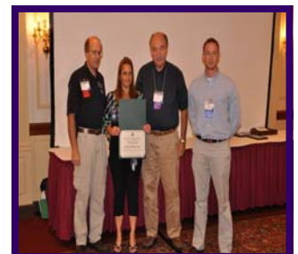
See page 5 for more pictures....