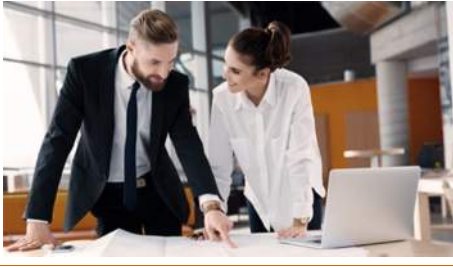
Self-Directed or Group Learning