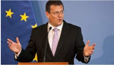
European Commission Vice President Maroš Šefčovič