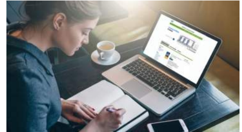
eLearning on Demand