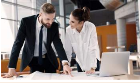
Self-Directed or Group Learning