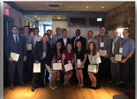
Boston Chapter Officers, BOG and Committee Members