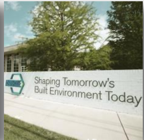
ASHRAE'S CORE VALUES