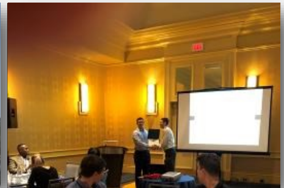
MIT Nano Tour