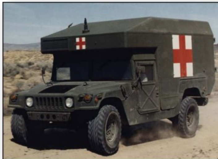
2018 Army Medical Group with Red Cross - Deployed in Iraq

Right after the 4th of July parade thru Natick, MA, I happened to stop by another Army medical detachment. These guys had an H1 Humvee that had a tent on the back that rolled out, and self-inflated. It created an instant tented OR suite. Heated, cooled, filtered, sterile, and portable -as much as the Humvee could drive. I got a tour from a Lt. Colonel, (Doctor as well) and talked to him about what I'd seen in NYC.