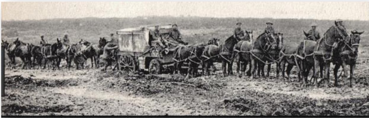
1918 Army Medical Group with Red cross - Deployed in France

I asked what he was doing. He told me his unit was a medical unit, and deployed with the troops to France. He noted my curiosity, and asked if I wanted a tour. My eyes lit up. I think what amazed me was the rudimentary medical devices of the time. Heck, they had a pot bellied stove for heat. Mix that with a little bit of Ether to add some spark to your day! No filtration, no cooling. Well, at least they had bandages, and anesthesia. Quite an interesting tour, and these guys were really devoted to accuracy.