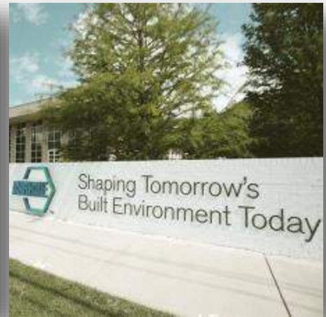
ASHRAE'S CORE VALUES