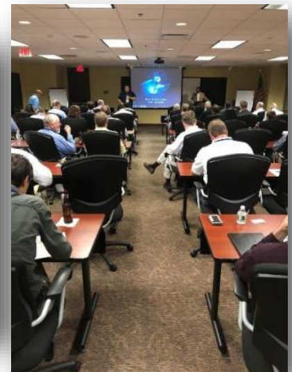
Last Meeting at Metro Meeting Center

Please register online at www.ashraeboston.org