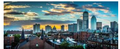
ASHRAE Boston Chapter Product Guide