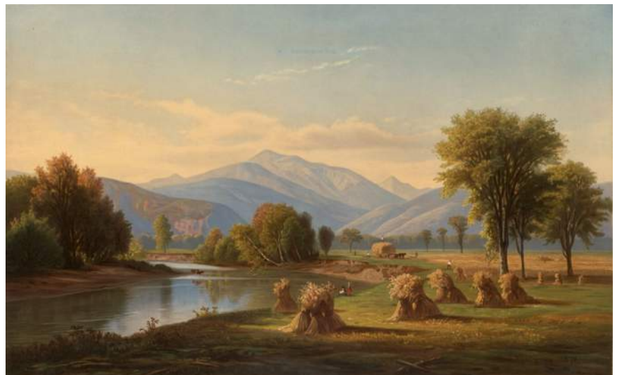
North Conway Meadows