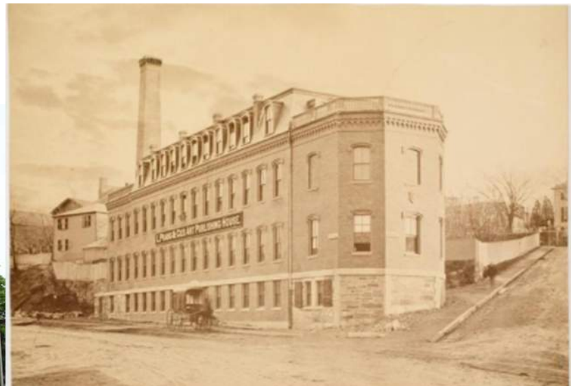
Rendering of Original Building