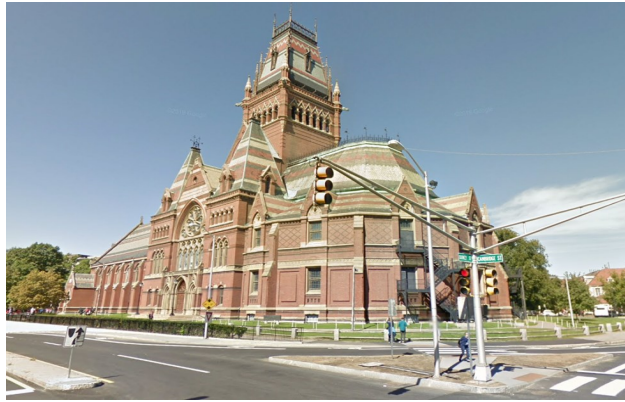
Photo of Harvard Memorial Hall in Cambridge, MA

The presentation focused on this great building. This is one of the many gems we have here in metro Boston that not many others in the rest of our country have. Really wicked cool old buildings. This building dates from the end of the American Civil War. It took a few years to design this beauty. A ceremony was held on October 6, 1870, to lay the Memorial Hall cornerstone. In 1874, less than four years later, the hall and the transept were dedicated for use. The Sanders Theatre was substantially completed in the spring of 1875 but not used until Commencement exercises in the spring of 1876. The clock tower was completed in 1877. The tower clock had a disastrous fire in 1956. The tower was restored but the clock was not added.