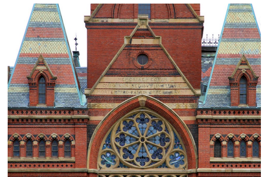
The Rose window at the south entrance

After the Civil War was over, a group of Harvard Alumni asked the school about building a memorial hall to honor the men who died in the war but also fill a very pressing need to build a dining hall and theatre for school events. The original