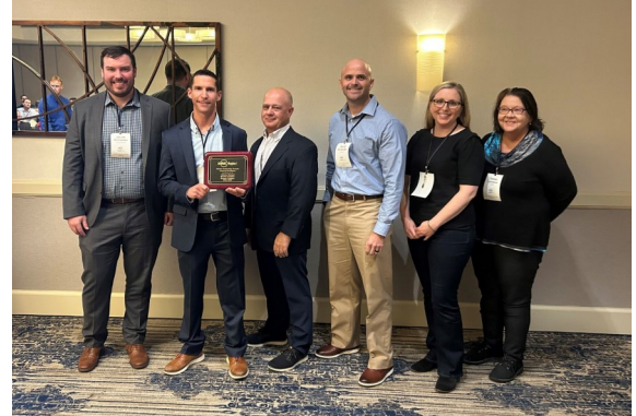
Liberty Mutual & CMTA receiving the Regional

As some of you may now, Liberty Mutual Insurance is headquartered in Boston. Their buildings at 157 Berkeley and 175 Berkeley/30 St. James are home to over a million sq ft of office space.