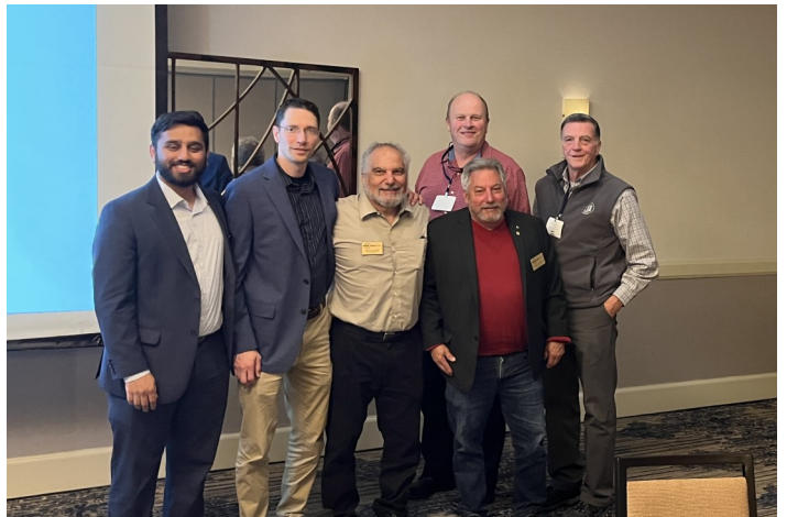
Past Presidents Night

Our next meeting is November 18 th at WPI in Worcester. We hope you can join us!